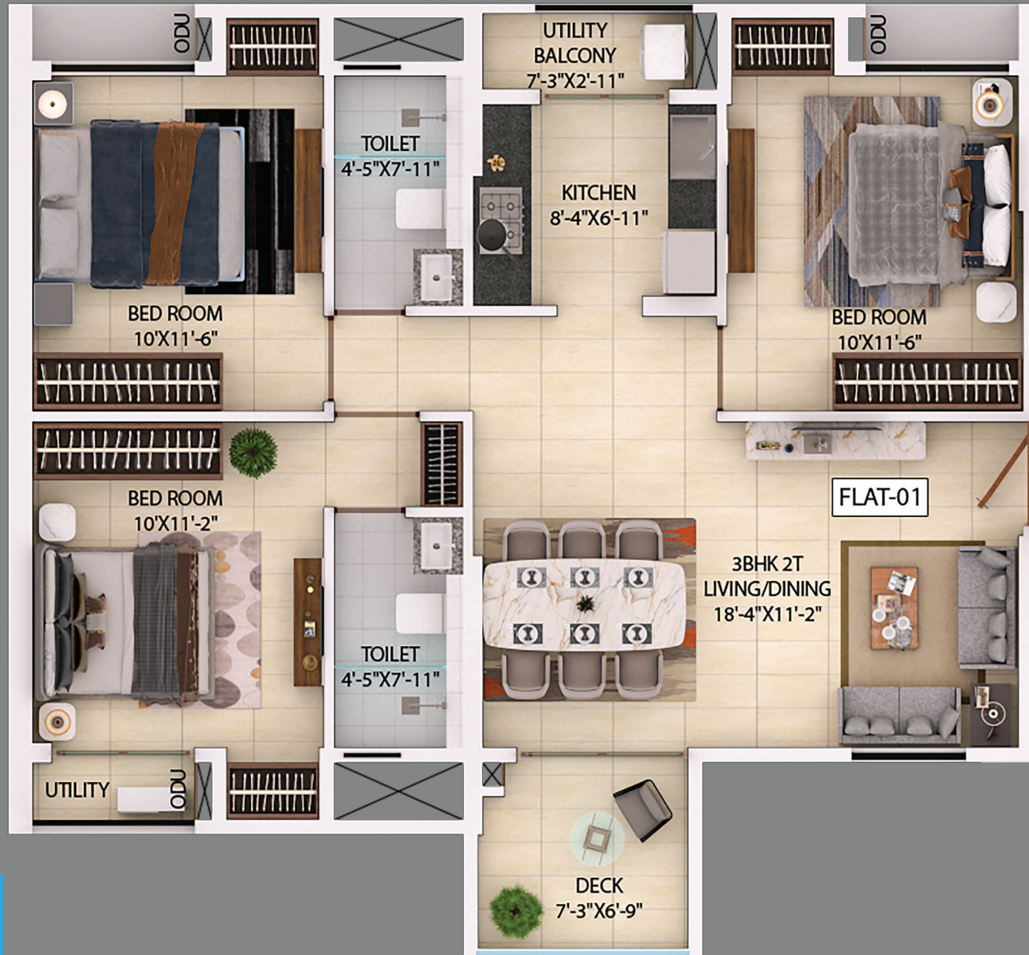
TOWER A - FLAT 1